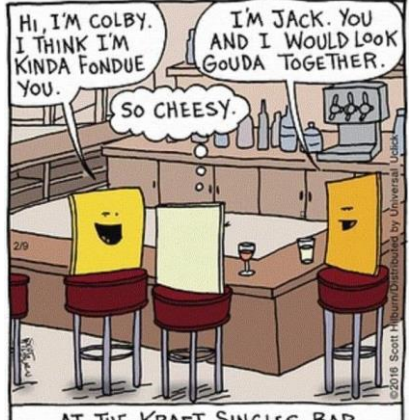
AT THE KRAFT SINGLES BAR